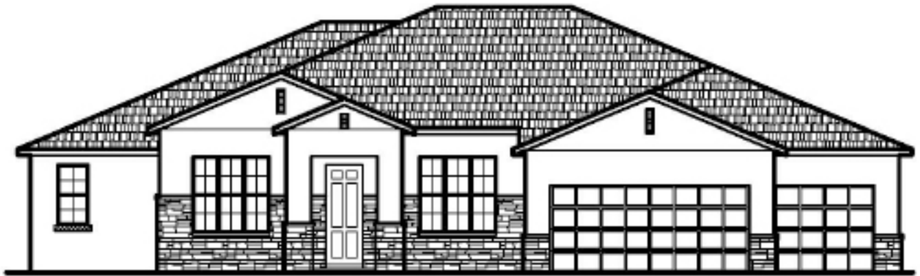
Elevation "A" w/ Stone Option