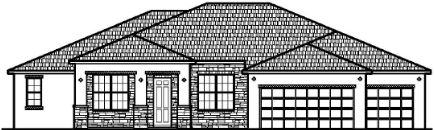
Elevation "B" w/ Stone Option